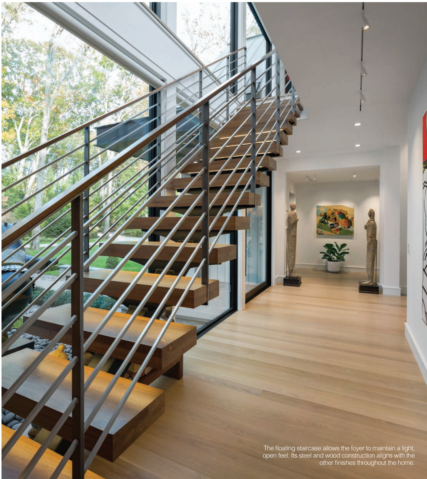
The floating staircase allows the foyer to maintain a light, open feel. Its steel and wood construction aligns with the other finishes throughout the home.

beautifully and resulting in a contemporary farmhouse with scaled-back detailing to keep it clean and light. Inside, rich walnut and white oak floors throughout adorn the home with warm tones and neutral walls. The use of natural light and organic materials like stone and natural-look wood siding connects the home to the flora and fauna on the beautiful property.