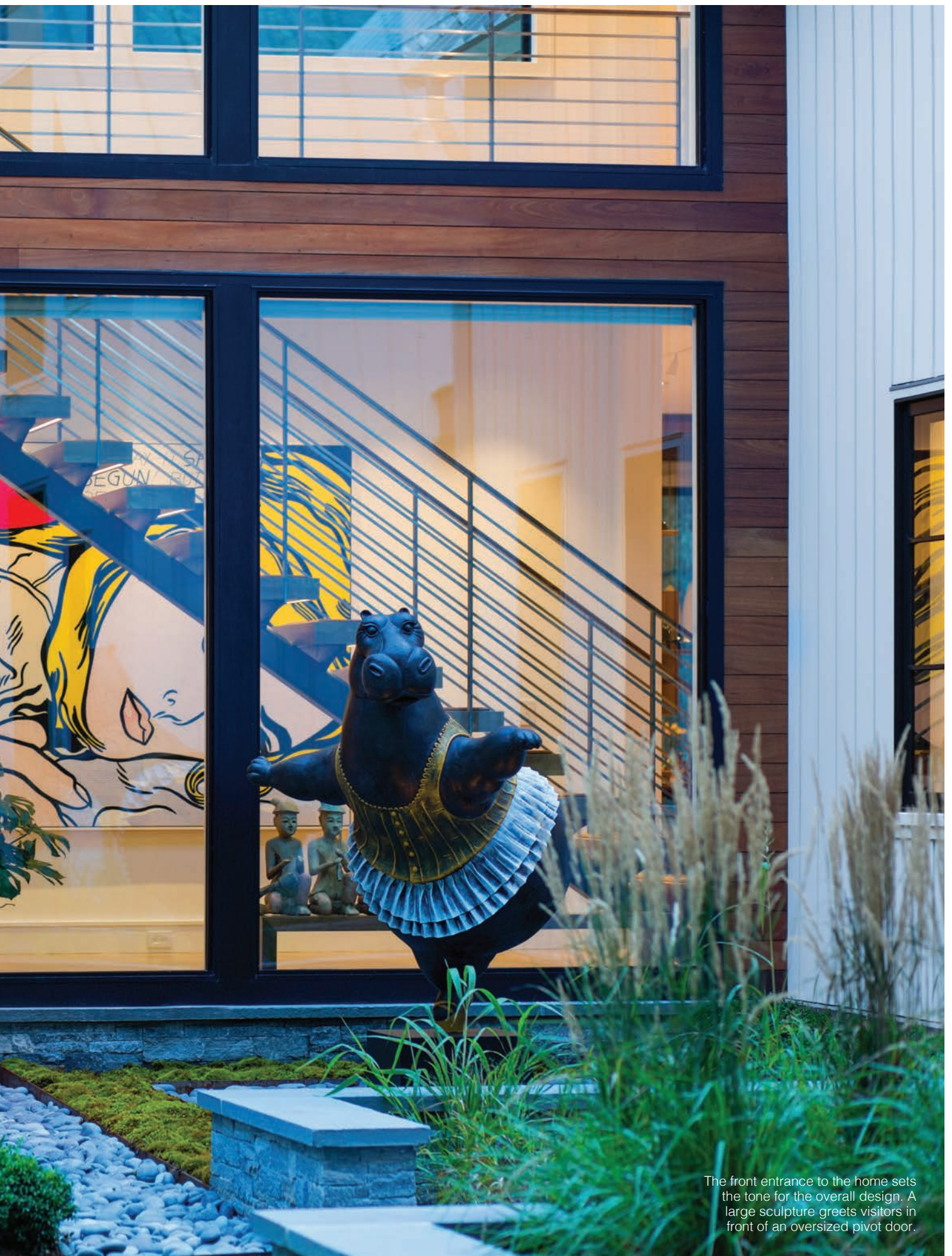
The front entrance to the home sets the tone for the overall design. A large sculpture greets visitors in front of an oversized pivot door.