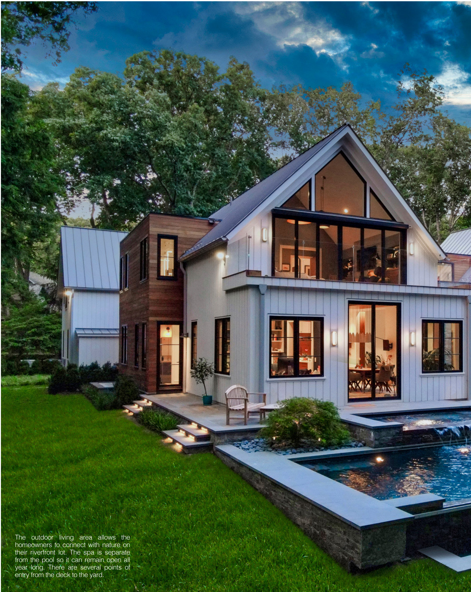
The outdoor living area allows the homeowners to connect with nature on their riverfront lot. The spa is separate from the pool so it can remain open all year long. There are several points of entry from the deck to the yard.